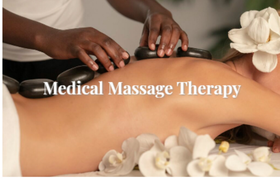
Medical Massage Therapy