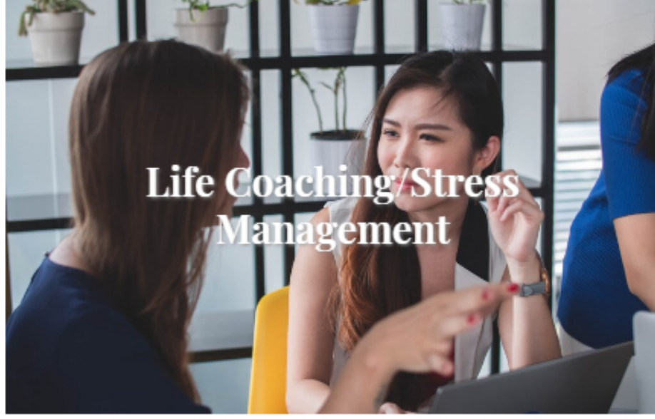
Life Coaching/Stress Management